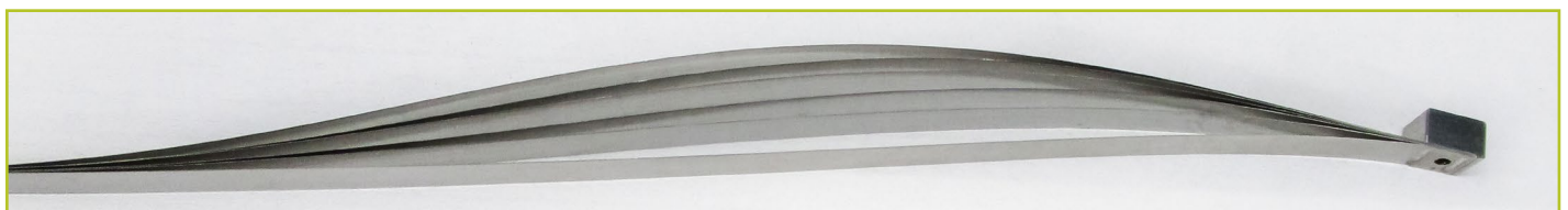
Belt Technologies PureSteel® multilayered drive tape.